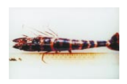
Figure 6-9. Penaeus monodon with early signs of red disease

Yellow to red discoloration in affected shrimps; histopathology of the hepatopancreas shows hemocytic infiltration in the spaces between the tubules; more advanced lesions are in the form of fibriotic and melanized encapsulation of necrotic tissues, either in the tubule itself or the sinuses around it.