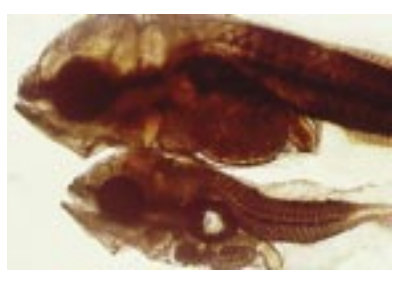
Figure 6-2. Seabass larva with Swimbladder stress syndrome compared with normal larva (top)

Swimbladder stress syndrome (SBSS) is associated with malfunction of the swimbladder and is also associated with a combination of handling, high ambient temperature, high ambient illumination, dense algal bloom that presumably cause oxygen depletion at night and supersaturation during the day.