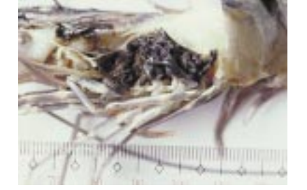
Figure 6-8. Penaeus monodon with black gill disease due to heavy siltation