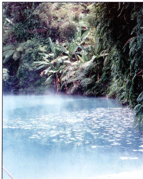
PNOC's Pook Kalikasan (at 1,300 meters above sea level), and Lake Agco (at 1,200 m) on Mt Apo in southern Philippines.