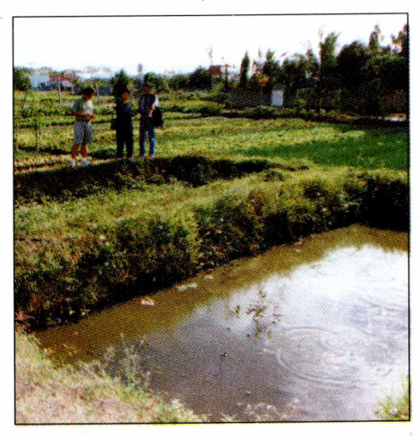
The Guardapes catfish ponds are ensconced in high value vegetable plots in a 1,700 m<sup>2</sup> residential area. Both commodities give sufficient income to support a family of five

250 m², two 135 m² and one 50 m² ponds stocked with catfish in Sta. Barbara, Iloilo. His ponds lie side by side and are equipped with an underground drainage. He harvests 500 kg per week from two ponds. His water supply comes from a deep well, and he changes pond water weekly. He stocks at 15 fish per m². Feeding is done twice daily at 3% body mass with a commercial feed. But he uses swine pellets instead of aquaculture feed because "it is cheaper." A 25 kg bag of pellets for fish costs P500 while that for swine is also P500 but contains 50 kg, and his catfish devour the swine pellets as they would the fish pellets.