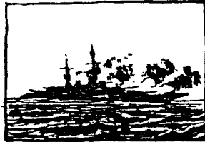
1941: The Bismarck