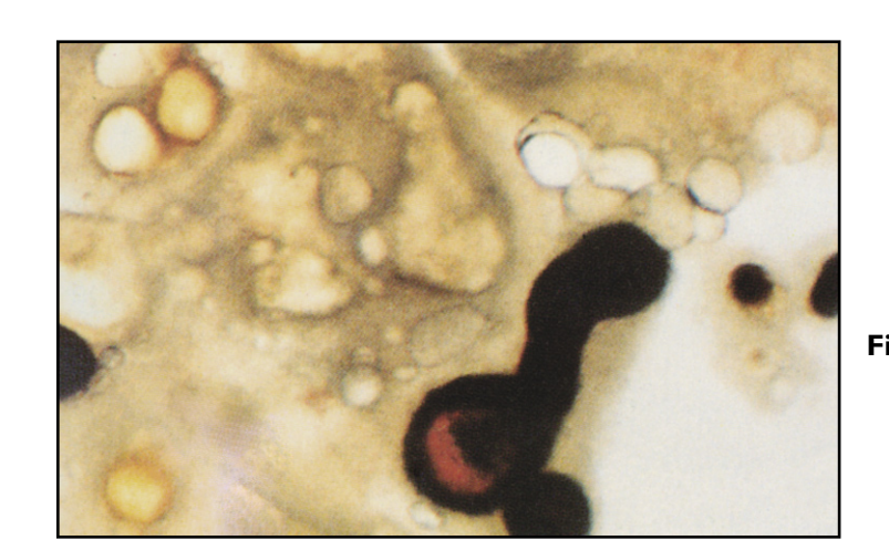
Fig. 3-3. Growing fungal hyphae surrounded by the host's cells which form the nodular lesions in affected tissues of Cromileptes altivelis.

Fig. 3-2. Whitish nodular lesions or granulomas observed in the muscle tissues of Cromileptes altivelis.