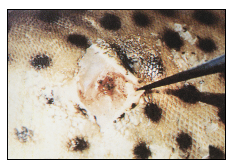
Fig. 3-2. Whitish nodular lesions or granulomas observed in the muscle tissues of Cromileptes altivelis.

Internal organs such as the spleen, liver and kidney become swollen and develop numerous white or cream-colored nodular lesions, up to 2 mm in diameter. Infected fish could also develop these nodules in the muscle tissues (Fig. 3-2). These nodular lesions in affected tissues are granulomas consisting of inflammatory cells surrounding spores or invading fungal hyphae (Fig. 3-3). When viewed under the microscope, these nodules could include the various life stages of the organism (early cyst, developed cyst and hyphae) in the affected tissues. The prevalence of ichthyophoniosis in most fish species affected increases with age.